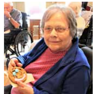
Pictured are several residents from Mapleview Lodge in Athens, ON enjoying their Smile Cookies.

We feel passionately about supporting BGH and the invaluable work the Foundation does for our hospital and the community. As the town's largest employer BGH is the heartbeat of our community and essential in every stage of our lives. As a proud Board Member of the hospital I have had the good fortune to watch the dedication and hard work that goes into managing the complexities of the hospital. BGH is supported by the finest and most dedicated professionals that we have seen in our careers, working every day to deliver the best in care to each and every patient who walks through the doors of our hospital.